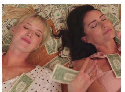
LANSINOH Imagine All The Possibilities