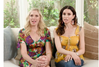
FABFITFUN Literally Obsessed