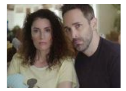
LANSINOH Top 5 New Parent Hacks