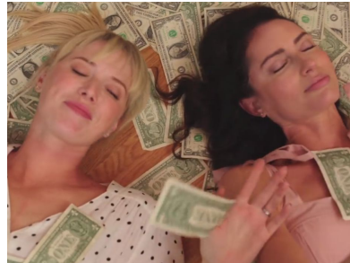
LANSINOH Imagine All The Possibilities