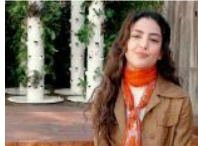
NYLON NYLON x Actress Medalion Rahimi