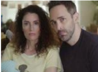
LANSINOH Top 5 New Parent Hacks