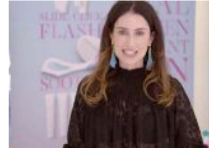
DERMAFLASH Discovering Dermaflash