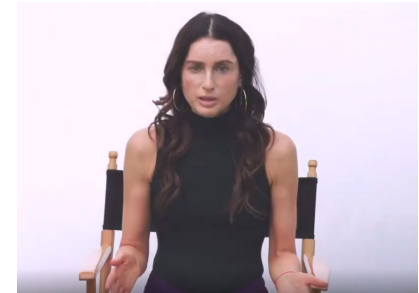
MODIBODI Confessions of a Leak