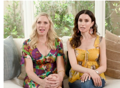
FABFITFUN Literally Obsessed